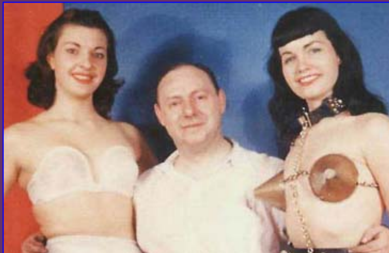
Irving Klaw (1911-1970) "The King of Pinup" & Bettie Page