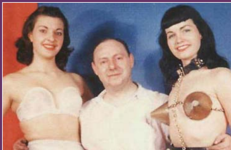
Irving Klaw (1911-1970) "The King of Pinup" & Bettie Page